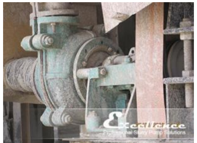
EHM-2C in Copper Concentration Plant in Africa