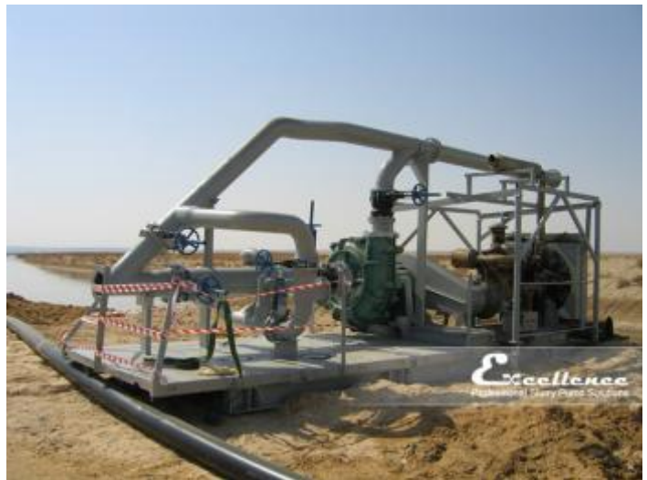
EHM-8ST in Mid-East