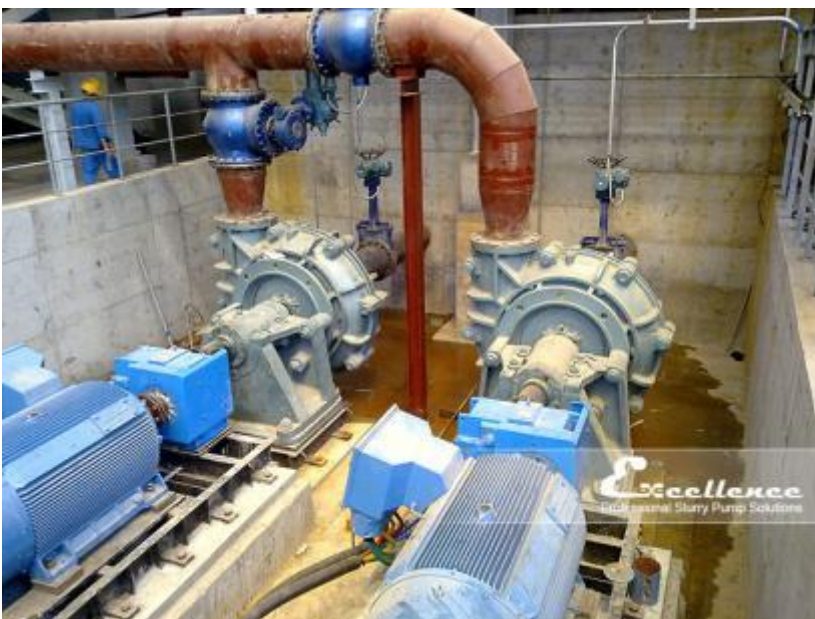
EHM-10ST in Gold Processing Plant in China