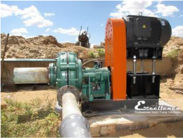
EHM-4D in Sand Excavation